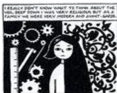
FIGURE 1. From Persepolis: The story of a Childhood . 2003: 6

Therefore, for young Marji wearing the veil develops in her a feeling of alienation from her friends and opposite sex at schools. She is fully cognizant of the fact that the veil, as a national symbol, separates her in copious ways, including body and mind. The first few pages reveal how the veil fragments her mind and identity when she states "I really don't know what to think about the veil, deep down I was very religious but as a family we were very modern and avant-garde" (6). She constantly struggles between her Islamic religion and her French, modern education. The young Marji, therefore, is undecided which to choose. To veil, she demonstrates her support and devotion to the country, and to unveil she would encounter a separation within her country as the women in the society are veiled. The following figure is sketched to show her fragmented mind and identity: