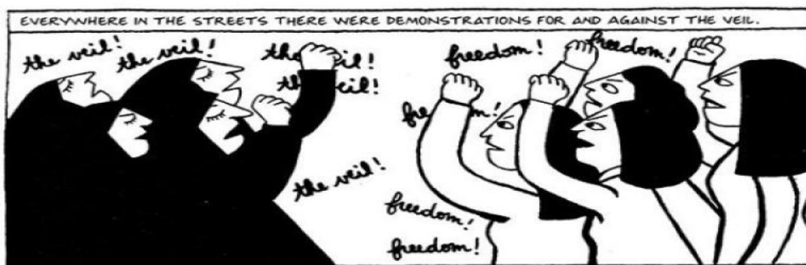
FIGURE 3. From Persepolis: The story of a Childhood . 2003: 5

Satrapi explains that in the Islamic Republic of Iran, the veil became a benchmark with which women are measured. Those who wear the veil are devoted believers and those who do not wear the veil are traitors and westoxified (Sichani 2007). The veil becomes a site of struggle and division. The author depicts this division of women when she tells the readers about the demonstration that happens after the Revolution. Satrapi shows how on the left side, women are all covered up with black chadors, while on the right hand, women are unveiled (5).