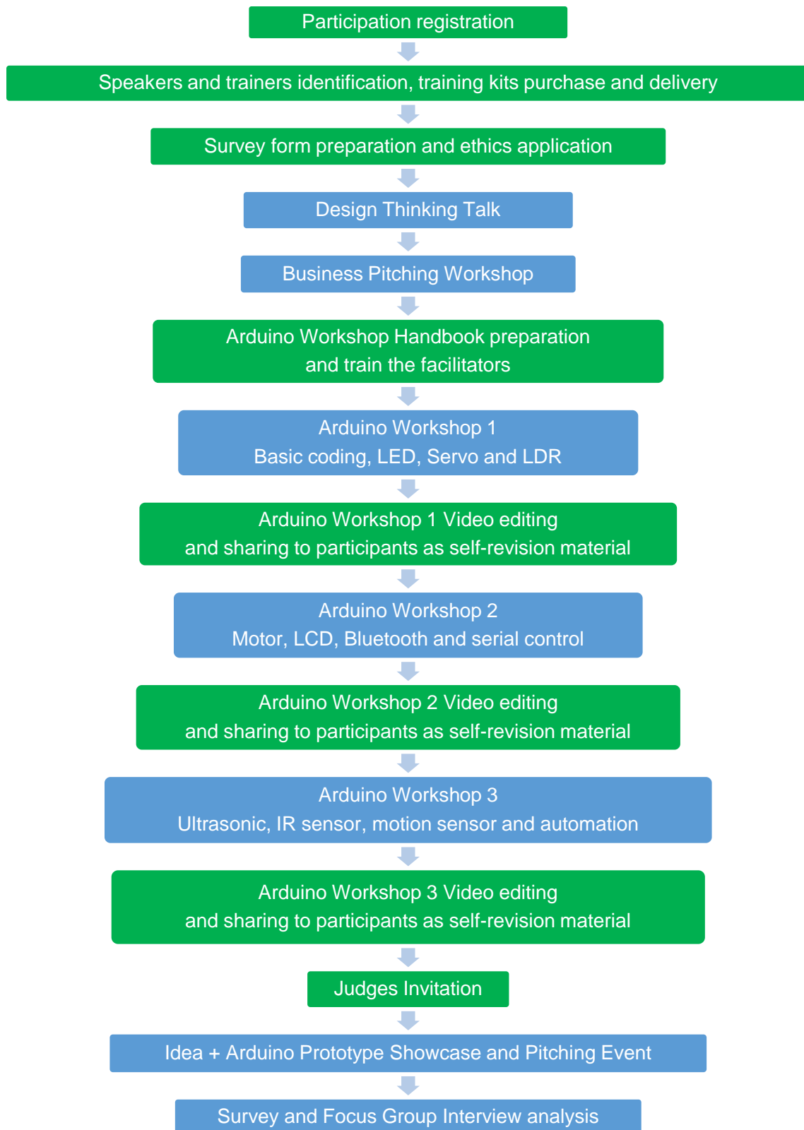
Figure 1: Flowchart of the project journey

Received: 14 September 2022, Accepted: 18 October 2022, Published: 20 December 2022 https://doi.org/10.17576/ajtlhe.1402.2022.07