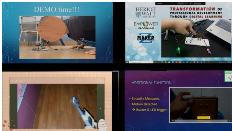
Figure 3: Live session during the final pitching session

the acknowledgement of growth in knowledge (cognitive) in the project. The survey demonstrated an enjoyable and satisfactory experience of the digitalisation of creativity.