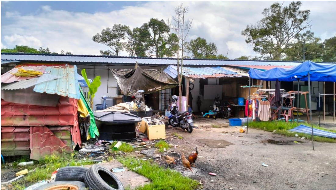
FIGURE 4. Rohingya refugees reside nearby and form a community in Hulu Langat, Selangor

However, we observed several other factors regarding refugees' tendency to live in areas with relatives or friends. Firstly, the presence of relatives or friends in the area provides crucial social support. They can provide emotional support and address needs and concerns to help sustain life. For example, if a family member runs out of food supplies, is short on money, or faces difficulties, acquaintances will immediately aid without seeking help from others, UNHCR, or NGOs. We found that refugees have strong bonds and support networks - CBO - among themselves. CBOs are vital in empowering communities, fostering social cohesion, and addressing local challenges through grassroots initiatives and collective action.