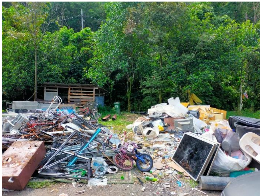
FIGURE 3. Rohingya refugees engage in the informal sector by gathering used items for refurbishment and resale

more exposed to the risk of harassment from the local population, who may feel uncomfortable with their presence or perceive them as challenging local job opportunities.