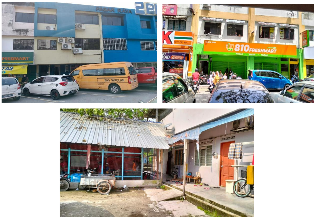
FIGURE 5: NGOs and CBOs are allowed to facilitate the establishment of refugee schools in Klang Valley