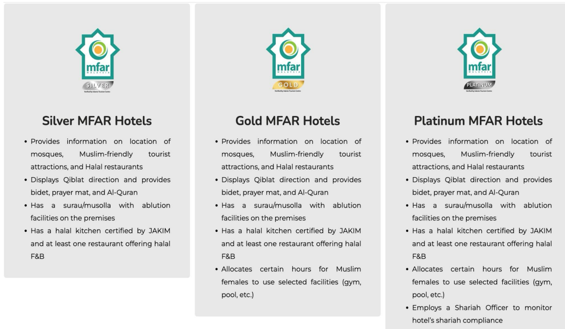
FIGURE 4. Categories of Hotel Accommodation

The ITC categorizes hotel accommodations based on three tiers: Silver, Gold, and Platinum which can be seen in Figure 4 which was retrieved from the Islamic Tourism Centre. Each tier provides different facilities that cater to various needs aligned with Sharia Law. This tiered approach ensures that businesses receiving the MFAR designation not only meet but exceed the expectations of discerning Muslim visitors while embracing the Muslim-friendly ethos.