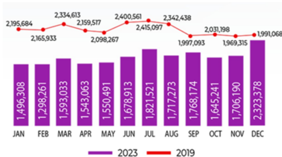
FIGURE 1. Malaysia Tourism Statistics\\

Based on Figure 1, it showcases the tourism highlights for Malaysia from January to December 2023. It highlights a significant increase in tourist arrivals, which totalled 20,141,846 in 2023. This represents a 100% increase compared to 2022, which saw 10,070,964 tourist arrivals, but a 22.8% decrease compared to the 2019 pre-pandemic figures of 26,100,784.