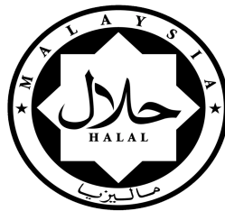
FIGURE 3. Halal Label

Halal-certified items bear a label or emblem that denotes certification by a recognised body which can be seen in Figure 3. When shopping for Halal foods, customers should search for this sign. It is crucial to remember that Halal certification criteria might vary between nations owing to differing interpretations of Islamic dietary regulations. However, international initiatives are underway to harmonise Halal criteria for more uniformity.