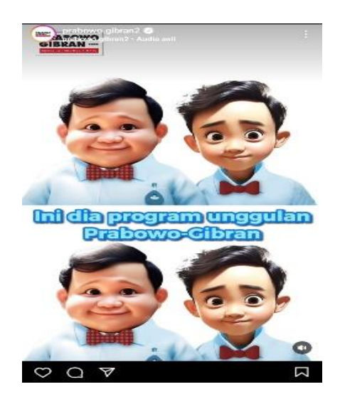
Figure 4. Custom Messaging Campaign Using AI Images

characteristics like race, age, ideology and religiosity. They tested whether they (AI) would vote the same as humans in the US presidential election. Using a human comparative database, research conducted by Argylea (2023) found a correspondence between how AI and human's vote. AI has the potential to replace human respondents in survey-style research.