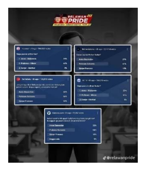
Figure 3. Use of AI in Surveys When Counting Candidate Votes

The electoral process is a demonstration of democracy, allowing voters to actively view the candidates. The 2024 Indonesian presidential and vice-presidential elections will be an opportunity for candidates to demonstrate their vision and mission uniquely and creatively. Each partnership has implemented a methodical campaign, with the main strategy focusing on the use of artificial intelligence (AI), such as the use of AI in surveys counting candidate votes.