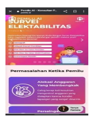
Figure 5. PEMILU.AI Campaign Platform

AI has penetrated to an extent that it can create AI generated visual candidates to be used in campaign strategies; among other campaign tools. The new approach helps those who frame policies to do much more and do it a lot more effectively than before by tapping into their knowledge and experience of the workforce for carrying out an analysis on demographics as well as communication objectives. Such messages are transmitted through various media vlogs, interviews, and short video material thus providing the candidates with sufficient methods of pushing their campaign narratives forward. AI may also be employed during elections among other things in analyzing campaign candidate's poster image like the degree of candidate smiles which can affect election outcomes. This is done when it comes to analyzing campaign candidate posters especially those of female candidates (Koo, 2022).