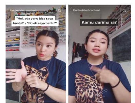
Figure 2. @jennifernatalie_'s content in educating sign language to the public

In delivering education about sign language, @jennifernatalie_ often delivers content where she delivers the material independently. Figure 2 provides two content illustrations where he delivers sign language educational material independently. Even though it is known that @jennifernatalie_ has a husband, she often delivers material independently. Social media itself has features to make it easier for someone to convey messages to their audience quickly, easily, and effectively (Babatunde, 2013). Through the nature of social media, it can be said that this media is inclusive and can be used by deaf people to communicate.