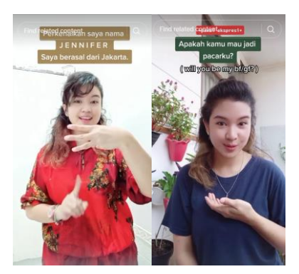
Figure 6. Content of using sign language to introduce yourself

The content packaging aspect explains the form or format of the content delivered by @jennifernatalie_ in educating sign language. In general, @jennifernatalie_'s content contains information about sign language and how to use it daily. The preparation and packaging of the message must of course be adapted to the target community so that it can be received easily and effectively. In dealing with her limitations in communicating verbally, there are strategies used so that the communication carried out by @jennifernatalie_ can be understood by the general level of society. The following is an illustration of content packaging carried out by @jennifernatalie_ to educate sign language.