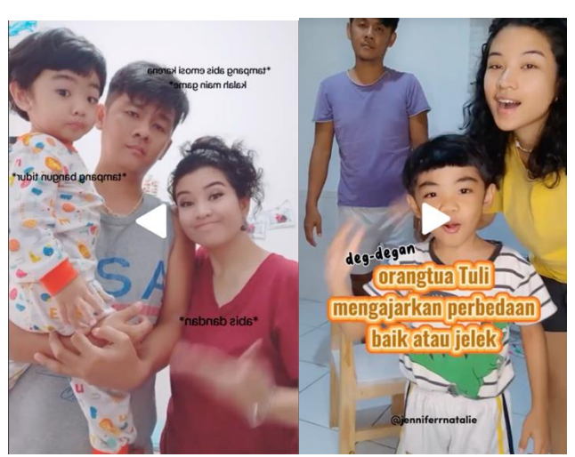
Figure 3. @jennifernatalie_'s content inviting her children and husband

Although @jennifernatalie_. able to deliver material independently, she often invites her children and husband to also deliver material about sign language to the audience. As a deaf mother, @jennifernatalie_ teaches her child sign language so that her child can communicate well with his mother and father. In this case, her child also follows the movements of @jennifernatalie_. in demonstrating sign language. Figure 3 below, @jennifernatalie_ is considered to have been able to collaborate with those closest to her in teaching sign language. This can provide the audience with their view of the reality of the relationship between a Deaf Mother, Deaf Father, and Hearing Child. It can be said that @jennifernatalie_ has been able to use her creativity as an SMI or content creator to create interesting content for the audience.