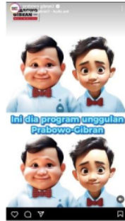
Figure 4. Custom Messaging Campaign Using AI Images

religiosity. They tested whether they (AI) would vote the same as humans in the US presidential election. Using a human comparative database, research conducted by Argylea (2023) found a correspondence between how AI and human's vote. AI has the potential to replace human respondents in survey-style research.