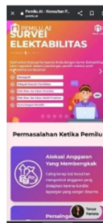
Figure 5. PEMILU.AI Campaign Platform

AI has penetrated to an extent that it can create AI generated visual candidates to be used in campaign strategies; among other campaign tools. The new approach helps those who frame policies to do much more and do it a lot more effectively than before by tapping into their knowledge and experience of the workforce for carrying out an analysis on demographics as well as communication objectives. Such messages are transmitted through various media vlogs, interviews, and short video material thus providing the candidates with sufficient methods of pushing their campaign narratives forward. AI may also be employed during elections among other things in analyzing campaign candidate's poster image like the degree of candidate smiles which can affect election outcomes. This is done when it comes to analyzing campaign candidate posters especially those of female candidates (Koo, 2022).