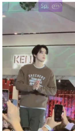
Picture 5 and 6: Promotional poster for the event and Cha Eun Woo on the day of the event.