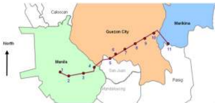
Source: Manila rail transit network map