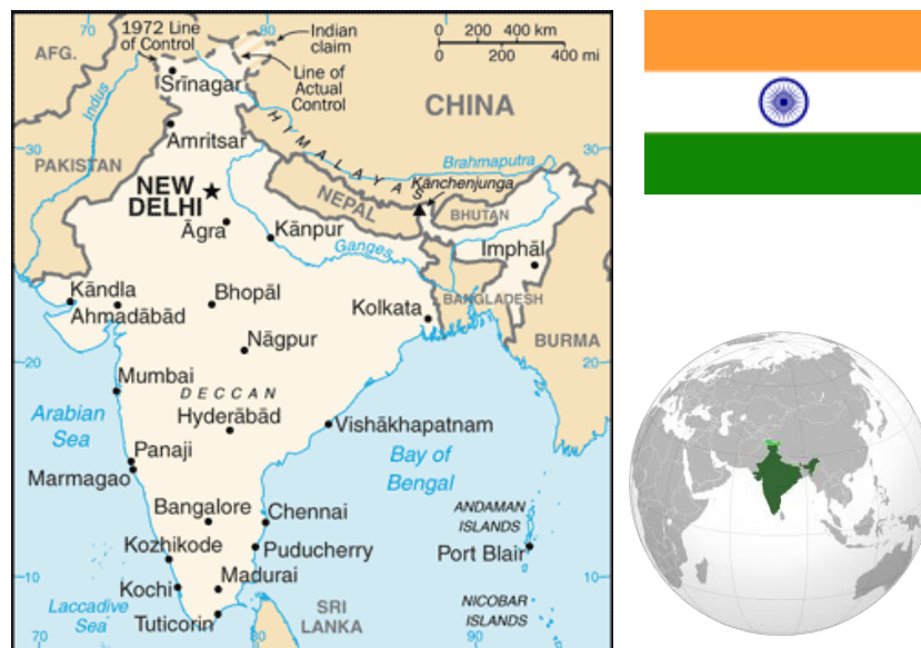
Fig. 1. Location of study

Despite pressing problems such as significant overpopulation, environmental degradation, extensive poverty, and widespread corruption, economic growth following the launch of economic reforms in 1991 and a massive youthful population are driving India's emergence as the world's largest democracy and a regional and global power.