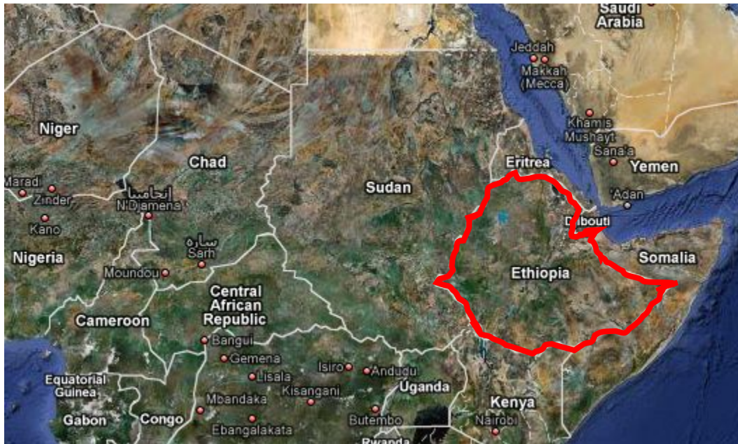
Fig 1. Location of study

The border crisis with Eritrea had resulted in Ethiopia losing its entire coastline along the Red Sea in 1993 and making it the most populous landlocked country in the world (Figure 1). The geologically active Great Rift Valley is susceptible to earthquakes, volcanic eruptions and frequent droughts. Ethiopia's current environmental issues include deforestation, overgrazing, soil erosion, desertification, and water shortages in some areas due to water-intensive farming and poor management (CIA, 2014).