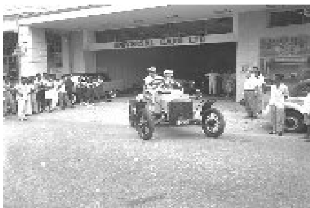
Figure 2: Wearne Brothers' 1909 Model Ford Genevieve in Singapore.

According to the Dodge brothers, Wearne became one of their most-prized agencies, while for Wearne, the Ford agency gave impetus to its automobile sales. 40 The agreement provided Ford the avenue it needed to break into the Malaya market. Wearne Brothers was made Ford's sole agent in 1911. From that point Wearne played an active role in promoting Ford cars in the Malayan market (see Figure 1).