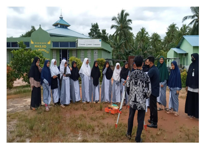
FIGURE 3 Measuring the Qibla Direction of Nur Murtaji Mosque Using Theodolite