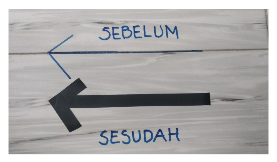
FIGURE 5 Comparison of Qibla Direction Before & After Calibration

From Figure 5 above, it could be seen that there was no deviation that occurred after a comparison was made between the previous and current qibla direction of Nur Murtaji Mosque. Because the method of determining the qibla direction of the Nur Murtaji Mosque uses the qibla azimuth method with the Theodolite instrument carried out by the Ministry of Religion at Bintan, so it can be concluded that the qibla direction of Nur Murtaji Mosque is accurate.