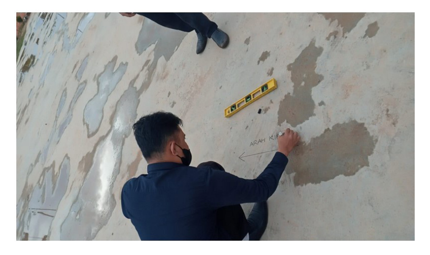
FIGURE 4 Marking Qibla Direction in the Outyard of Nur Murtaji Mosque

After marking the Qibla direction in the outyard of Nur Murtaji Mosque, a straight line was drawn using a thread so that it could reach the floor of Nur Murtaji Mosque. After that, a sign of the qibla direction was made on the floor of Nur Murtaji Mosque so that it could be compared with the previous qibla direction of Nur Murtaji Mosque.