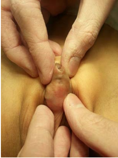
Figure 1: Fistula opening on the ventral aspect of the penis