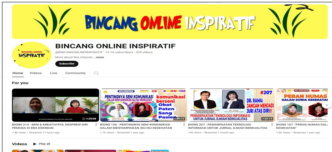
Figure 2: BIONS YouTube channel: Bincang Online Inspiratif ( https://www.youtube.com/@BINCANGONLINEINSPIRATIF )

Additionally, the channel enjoys a strong online presence with 11,000 followers on Instagram, expanding its reach beyond the [YouTube platform. Complementing the YouTube channel, BIONS also operates a website, offering an additional avenue for accessing health-related content and fostering a holistic online community.